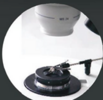
Gems - Inspection Accessories