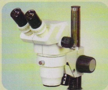
MSZ-BI Binocular Version

STEREO ZOOM MICROSCOPES FOR BIOLOGICAL & INDUSTRIAL USE