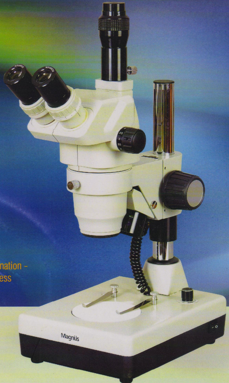
MSZ-TR Trinocular Version

Options for Reflected and Transmitted illumination - Top halogen lamp 6v15w adjustable brightness bottom fluorescent lamp 5w