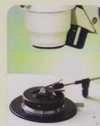
Gems - Inspection Accessories Darkfield attachment (with specimen holder) for inspection of Gems & Micro samples under transmitted light